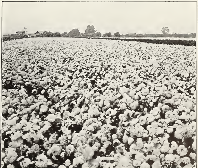
FIELD VIEW OF ASTERS—CALIFORNIA GIANT